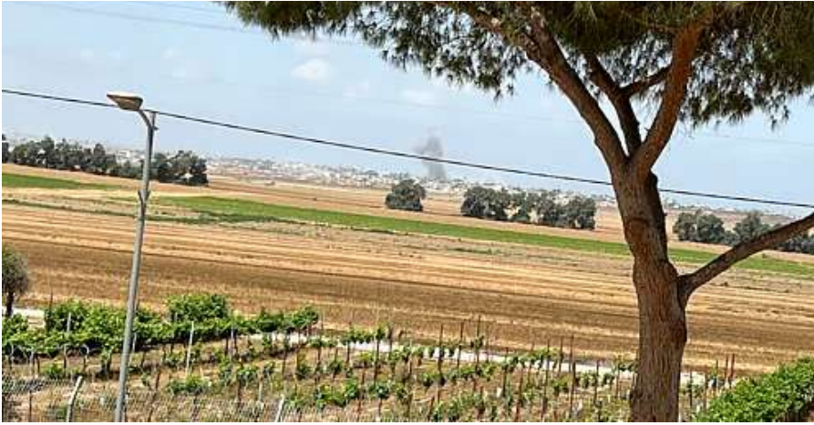
Israeli artiller stike as seen from Nir Oz

NEWS OPINION WATCH BUSINESS FEATURES DONATE ABOUT US PUBLICATIONS FAQ