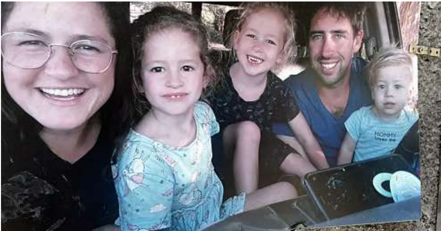
Slain family

NEWS OPINION WATCH BUSINESS FEATURES DONATE ABOUT US PUBLICATIONS FAQ