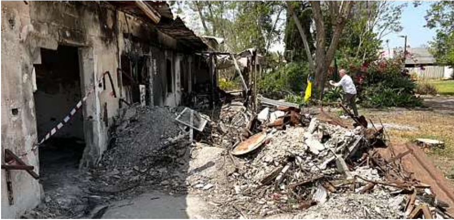
Remains of a house in Nir Oz

NEWS OPINION WATCH BUSINESS FEATURES DONATE ABOUT US PUBLICATIONS FAQ