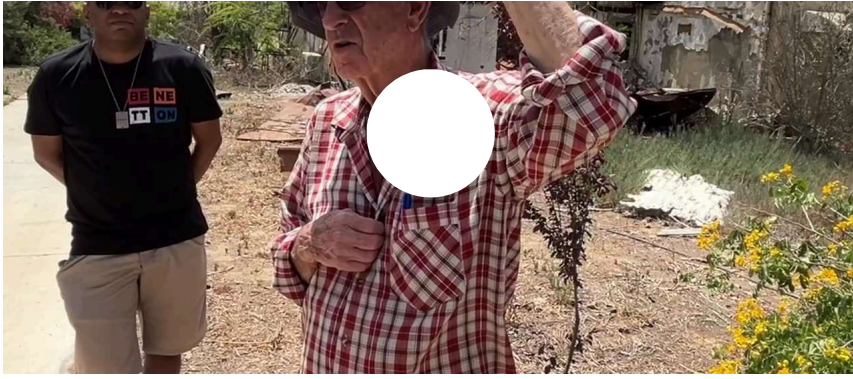
Remains of a house in Nir Oz

NEWS OPINION WATCH BUSINESS FEATURES DONATE ABOUT US PUBLICATIONS FAQ