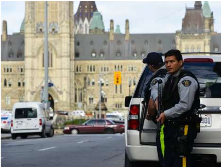
Police lock down Parliament Hill in Ottawa following a shooting in 2014.

Canada is undergoing a quiet but profound erosion of national cohesion, authority and cultural confidence. At every level of government, political leadership has increasingly substituted ideological appeasement for the basic responsibilities of maintaining social order, enforcing the law and protecting the integrity of Canadian citizenship.